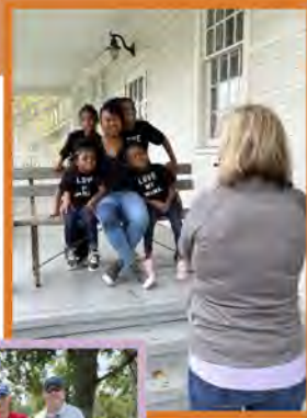
Portraits on the Porch